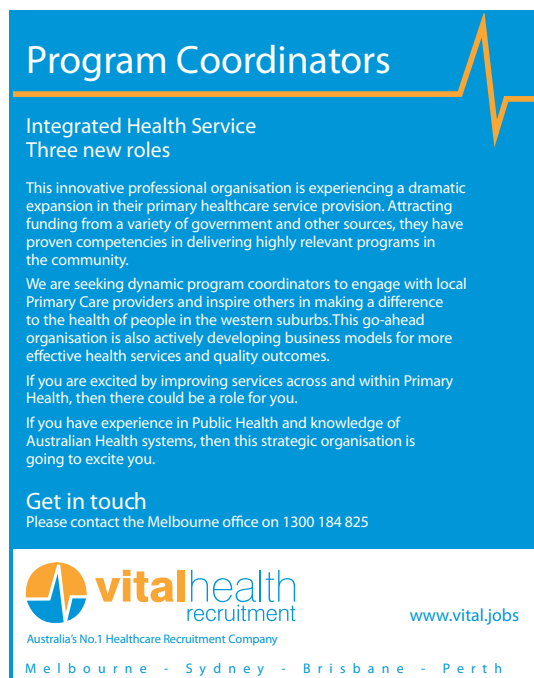
Samples of a advertisements

Additionally, this form of advertising may not be as expensive as you may think. Speak with your Vital Health consultant about how we can structure a package that will cut your display advertising costs dramatically.